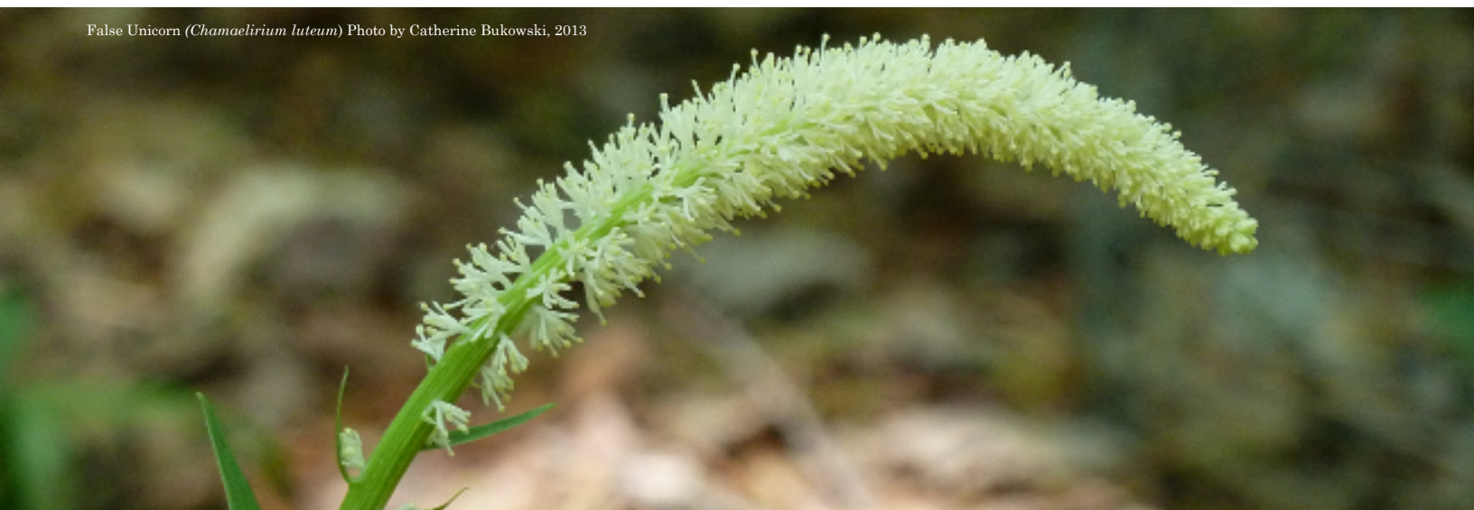
False Unicorn ( Chamaelirium luteum )

Department of Forest Resources and Environmental Conservation, Virginia Tech