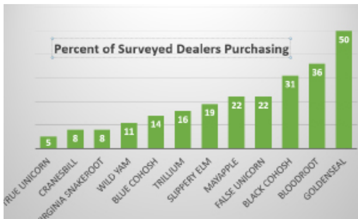
Figure 1. Percent of surveyed dealers purchasing.

Our questionnaire focused on native medicinal plants other than ginseng that are harvested in forests. Of the registered ginseng dealers who responded to our survey, 61 percent reported buying other plant products. Our survey asked for specific data on 11 roots and one bark. Figure 1 shows the percentage of buyers who purchased each of these plants. The most commonly purchased products were goldenseal, bloodroot and black cohosh. Some participants listed other products not included in the survey. These included witch-hazel leaves and bark, wild cherry bark, stone root, sassafras, wild hydrangea and squaw vine. A few participants bought plants for the floral industry, but most dealt exclusively